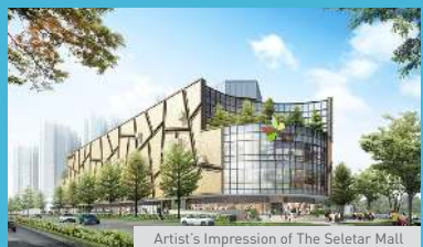
Artist's Impression of The Seletar Mall