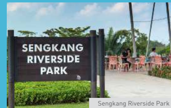
Sengkang Riverside Park