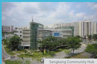
Sengkang Community Hub