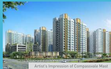
Artist's Impression of Compassvale Mast