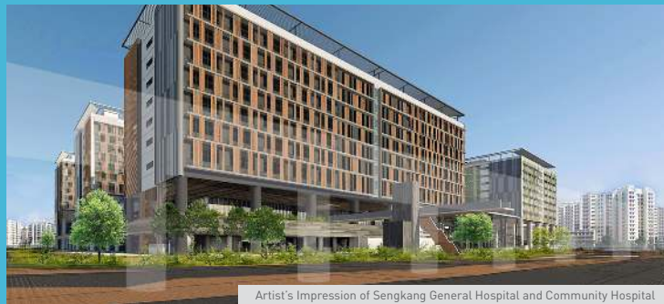
Artist's Impression of Sengkang General Hospital and Community Hospital